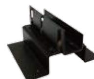
Cylindrical cell holder