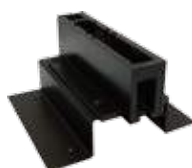
Thermo-fluid cell holder