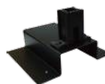
Single cell holder