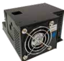
Thermo electric cell holder

The SP-8001 offers advance temperature control accessory. User will have the option to use a standalone thermal electric for temperature control or use a re-circulating water circulating bath for temperature control.