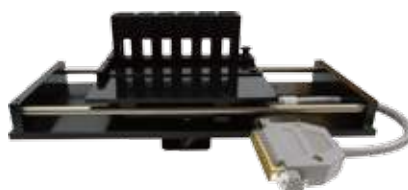
Automatic 6 cell holder

The 6 cell changer on the SP-8001 provides a simple automatic method to measure multiple samples at once. User can designate one position as blank leaving a total space of 5 samples to be measured.