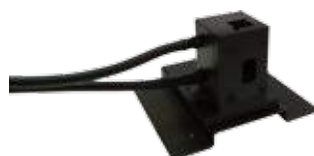
Thermo fluid cell holder